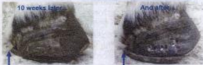
Still a short toe, and still has heel support.

Unlike a rim shoe, the Cytek shoe isn't pulled forwards with the toe growing long, instead the shoe allows the horse to trim it's own toe.