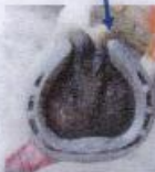
5 Weeks later with imitations.

No, the shoe spreads, break-over changes and all the weight is on the outer wall and the heels contract.