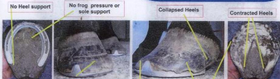
Front wall rasped away, to shorten the toe, now damaged.