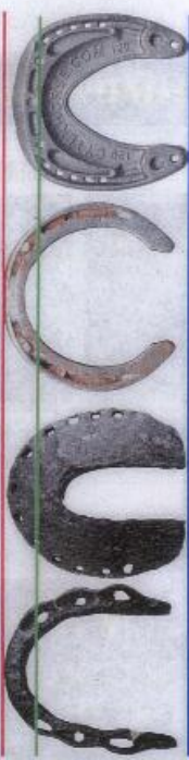
Present day rim shoe